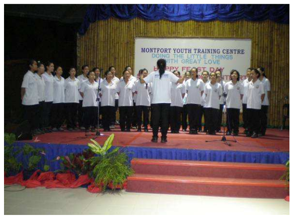
"Montfort Cry" by the girls during the feastday.