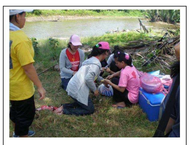
The girls rummaging from their package