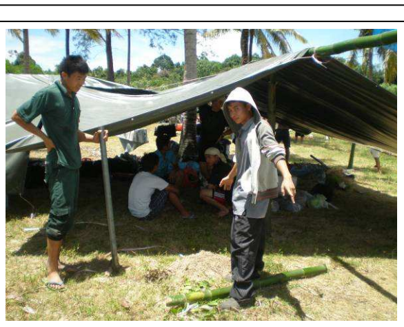
Building the tent

The month of April was concluded with an out door camping activities at Kuala Penyu from 29<sup>th</sup> April to 1<sup>st</sup> May. All the students spent three days and two nights camping by the sea side. Some of the students were like "fried prawns" because of sun burnt. Tired were they upon returning to the campus but none the less, they had enjoyed all the activities during the camping. The instructors from all the workshops were also involved in the camping.