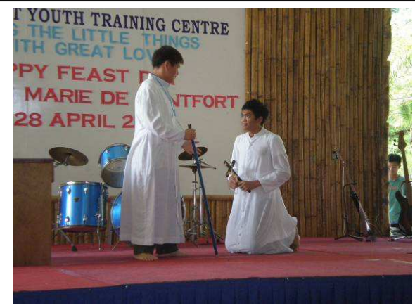
Montfort's life on stage by the students

The month of April was concluded with an out door camping activities at Kuala Penyu from 29<sup>th</sup> April to 1<sup>st</sup> May. All the students spent three days and two nights camping by the sea side. Some of the students were like "fried prawns" because of sun burnt. Tired were they upon returning to the campus but none the less, they had enjoyed all the activities during the camping. The instructors from all the workshops were also involved in the camping.