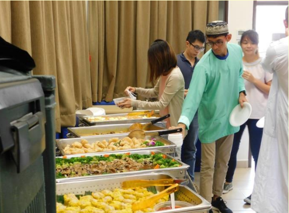
Abundance of food to satisfy the hungry stomach

A simple lunch reception was organized by the staff of Boy's Town on the 28<sup>th</sup> June, to mark the Aidilfirtri (end of fasting month for the Moslems). It is in soladirity with the Moslems staff that the celebration was held. It is also a sign of unity and harmony of the multi-religious and multi-cultural Singaporeans. Selamat Hari Raya to all Moslem brothers and sisters.