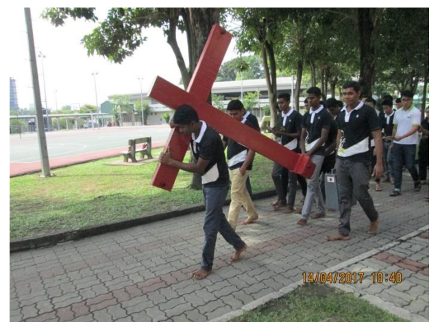
The Stations of the Cross during Good Friday