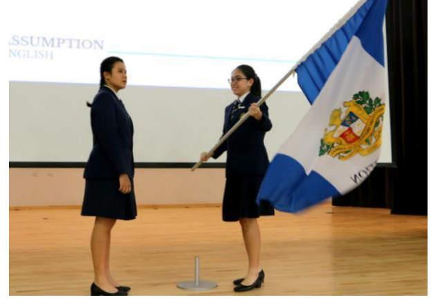
The handover of the school flag signifies the handing over of duties from the outgoing President to the incoming President of the Student Council.