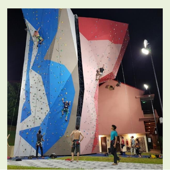
A corporate programme using bouldering wall to conduct their conflict management workshop.

Boys' Town received the Certificate of Statutory Completion in April to begin running the Adventure programme. So far several groups of students, companies and members of the public have scaled the high walls, abseiled the 15m tower and climbed the indoor bouldering wall. The adventure centre has conducted over 16 programmes and has reached out to over 800 people through talks, conferences and workshops. In the coming months, the centre aims to connect with more clients and especially youth at risks to benefit through the elements of adventure.