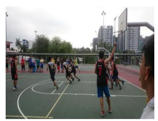
Friendly basketball match with church group

Friendly football matches with Alam Mega Team. Pix above showed the Mega Alam team.