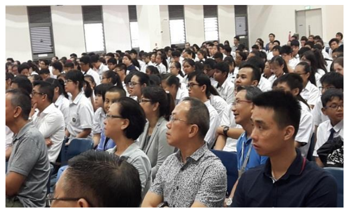
APS staff and students at the Founder's Day Mass

A number of Catholic activities for staff and students took place in the second quarter of this year.