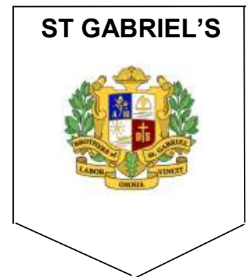
Placement of Name Tag