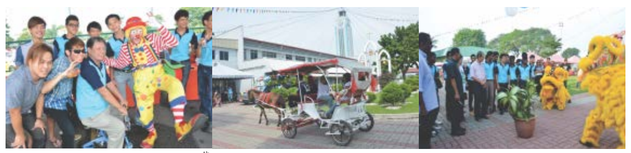
It was Carnival Day again on 4<sup>th</sup> May 2014 and many people came to support our Fund Raising Event. Last year's crowd was smaller due to the date of GE13 which clashed with our event, but a