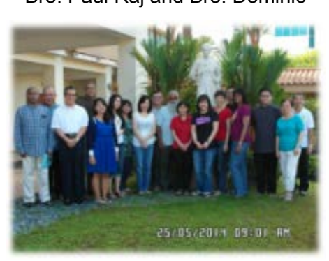
Those whowneedkeritethrough the