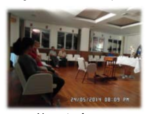
Moments of prayer